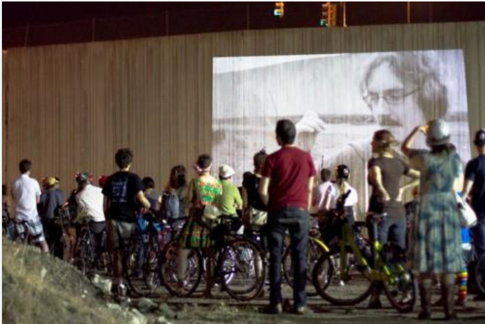
Mobile Experiential Cinema at Northern Spark '11