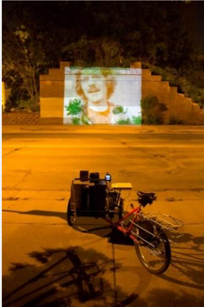
Mobile bike projector

projection and the conflation of the real and imagined in actual space. Essentially, the audience gets to be in a real place that supports the story instead of simply seeing the filmed set of a film.