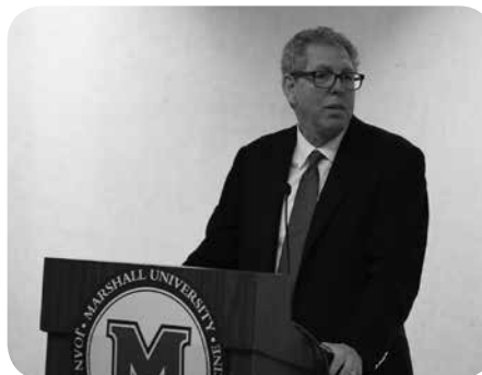
Dr. Jeffrey M. Friedman

The day-long conference featured a presentation given by Jeffrey M. Friedman, M.D., Ph.D., titled "Discovery of Leptin Gene and the Biologic Basis of Obesity." Dr. Friedman, who discovered the obesity gene leptin, is a professor at The Rockefeller University and an