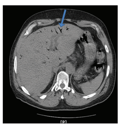
Figure 1: Computed tomography scan of the abdomen showed extensive portal venous gas, mesenteric venous gas throughout the abdomen

pressure. Empiric intravenous antibiotics and analgesics were administered. Before the patient was taken to the operating room for the diagnostic laparoscopy to find out the cause of portal vein air, CT scan of the abdomen was repeated and it was done 5 h after the first CT abdomen. The repeat CT scan revealed near complete resolution of the portal venous gas and mesenteric venous gas [Figure 2]. Next day abdominal X-rays were done, which were also negative for extra luminal air. Septic workup including blood culture, urine culture, stool for clostridium difficile, HIV, hepatitis A, B, C was negative. Hepatobiliary iminodiacetic acid scan was also negative for acute cholecystitis and showed a patent biliary tree. After 4 days in the hospital, the patient's clinical condition improved and he was subsequently discharged home.