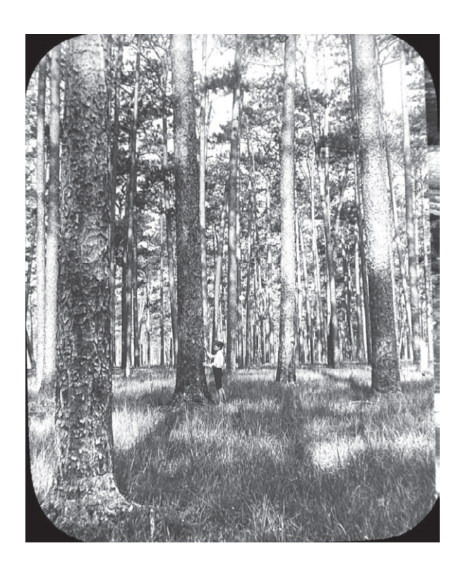
Fig. 2. Photograph of old-growth Pinus palustris stand, ca. 1902, Baldwin County, Alabama.

scenarios indicate changes in both fire and hurricane regimes. Given the complex factors that influence global weather phenomena such as tropical storms, it is not surprising that much debate remains regarding the potential impact of global warming on tropical storm fre-