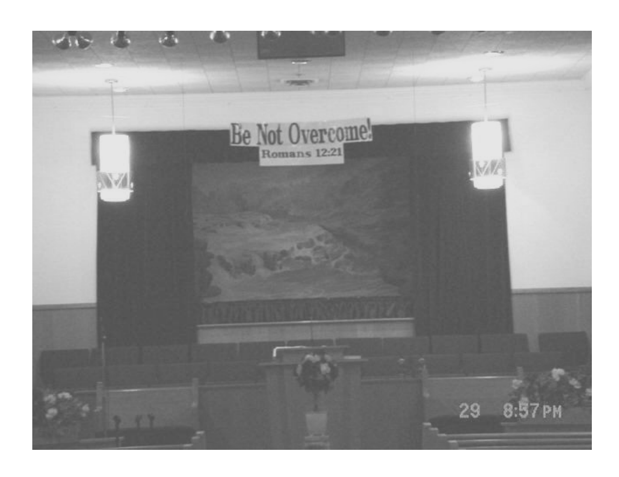
Image 4 - Close up view of the Sanctuary, the pulpit, choir section, and the baptistery