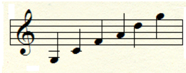
Ex. 1: Tuning of the Six-Course Vihuela

It is quite possible that a reader may not be familiar with the song forms such described in the last paragraph. Thus, an explanation is appropriate at this point. The first one to be discussed is the villancico . Rooted in the word villán , meaning peasant, it was of extreme importance in Spanish secular music. It had a poetic structure that could vary, and was connected with the Italian balatta , the French virelay , and the Arabic zajal . Earlier villancicos had courtly love as the favorite theme, although later types approached themes with religious or popular contents. The form of the villancico was typically in