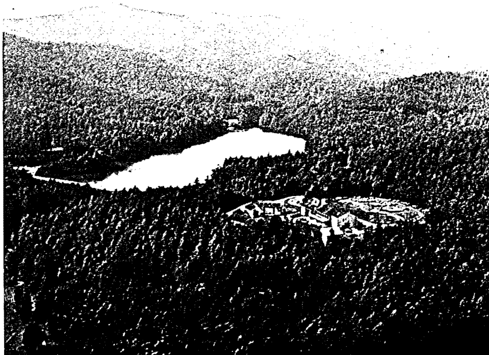
March 23-25, 1990