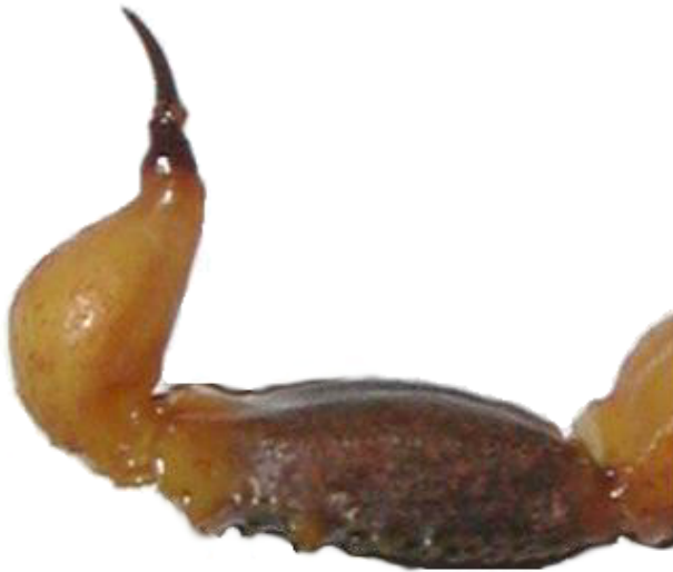
Figure 2: An abnormal structure on telson of L. quinquestriatus (scale: 1 cm).