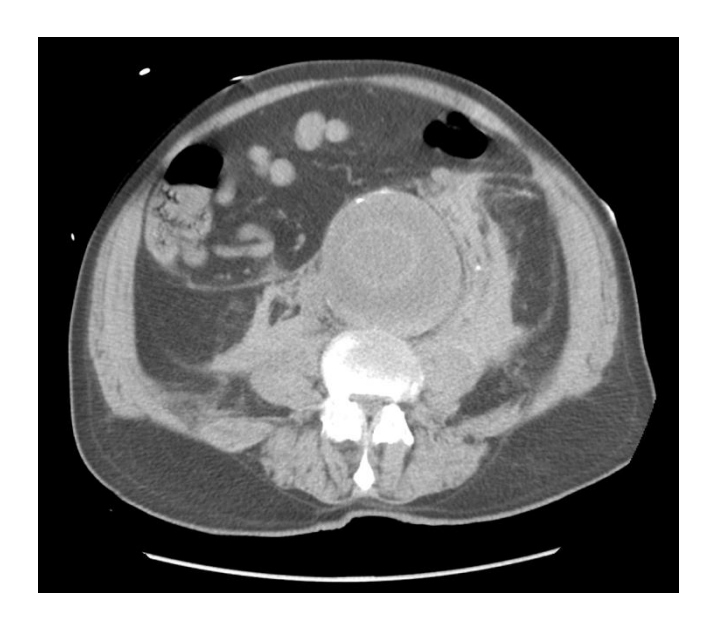
Figures C and D: Abdominal Aortic Aneurysm

An emergent call was placed to cardiothoracic / vascular surgery, and the patient was immediately evaluated. A brief discussion revealed that there was no graft available large enough for an endovascular repair (EVAR), and he was taken to the OR for emergent open AAA repair. During the procedure he was found to have thrombus and plaque within the aneurysm cavity with complete posterior and left lateral aneurysmal tear, and a 16mm Hemashield graft was used for the repair. Hemoglobin (Hb) on admission trended down from 11.5 to 9.7 immediately prior to the OR, he was transfused to a hemoglobin of 11.2, and this trended down to a nadir of 7.3 four days post-surgery. Dual antiplatelet therapy was by necessity continued, and he was again transfused, for a total of 8 units. Repeat CT abdomen revealed significant improvement in retroperitoneal hemorrhage, though he was found to be positive for fecal occult blood. He was evaluated by gastroenterology, upper endoscopy the following day revealed gastritis and a nonbleeding gastric ulcer, and he was started on a proton pump inhibitor. The rest of the patient's hospital course was complicated by atrial tachycardia, acute kidney injury, and confusion, all of which resolved with appropriate treatment. He was evaluated by physical therapy and inpatient rehab was recommended, though the patient declined and was ultimately discharged in good health, with Hb over 8. He did not keep his follow-up visit with cardiology.