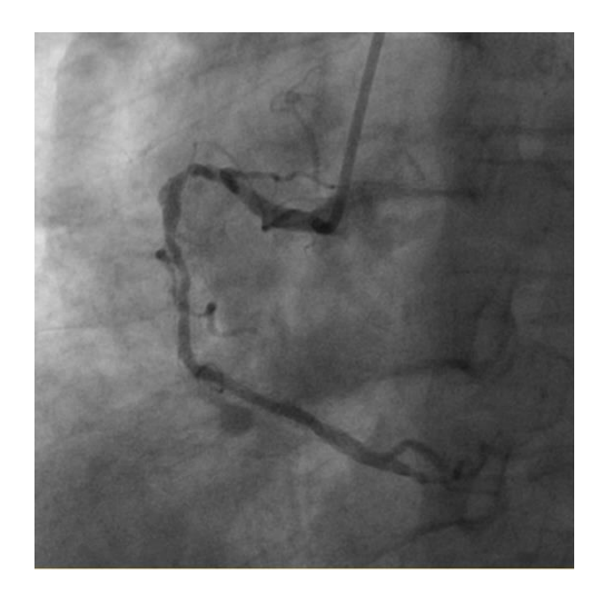
Figure B: Right coronary system, LAO projection