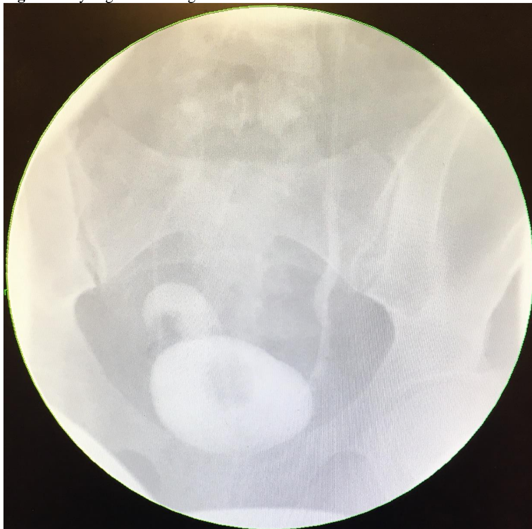
Figure 1. Cystogram showing bladder diverticulum at bladder dome.

large 4x4.3x2.5 centimeter diverticulum was observed in the right anteroposterior portion of the bladder ( Figures 1-2 ). No leak was observed. Cystoscopy was performed on post-operative day 18 and a diverticulum was noted at the dome of the bladder. The ureteral stents and Foley catheter were removed. The patient was instructed on timed double voiding. She was seen for 12 week follow up and was experiencing frequency but this gradually improved since Foley catheter removal.