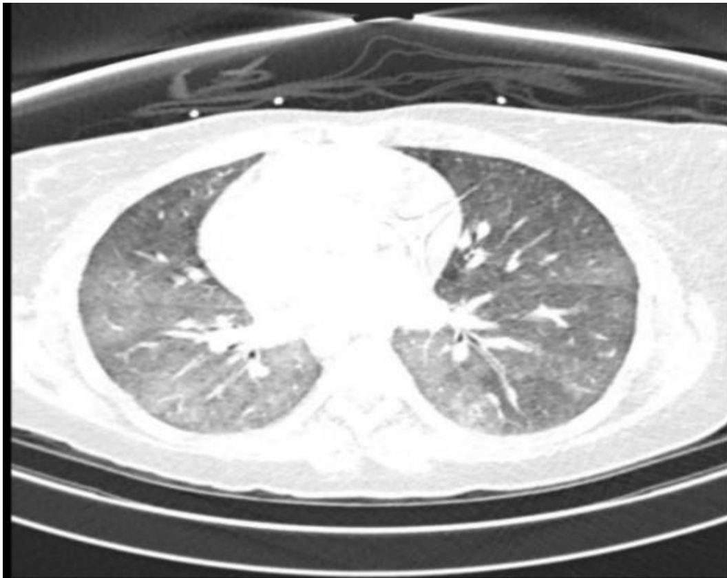
Figure 3: CT Angiography of chest: Confluent diffuse bilateral ground glass opacities/confluent airspace consolidations with a subtle dependent gradient of airspace opacity.

Computerized tomography angiography (CTA) of chest was significant for diffuse adenopathy and ground glass opacities as seen in Figure 3 .