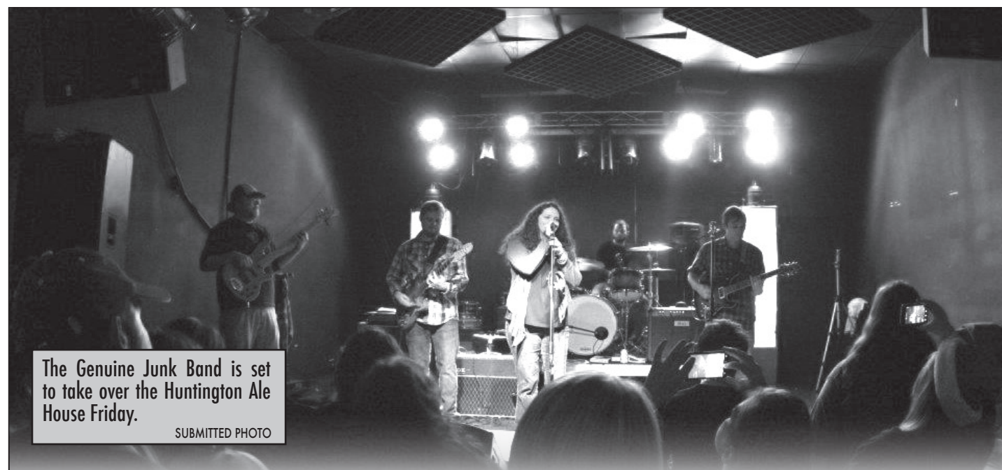
The Genuine Junk Band is set to take over the Huntington Ale House Friday.