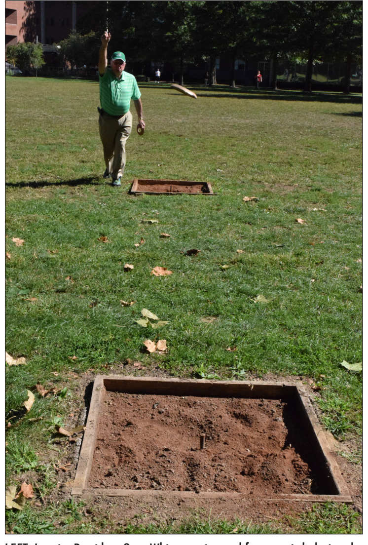
quoits tournament Wednesday on Buskirk Field.