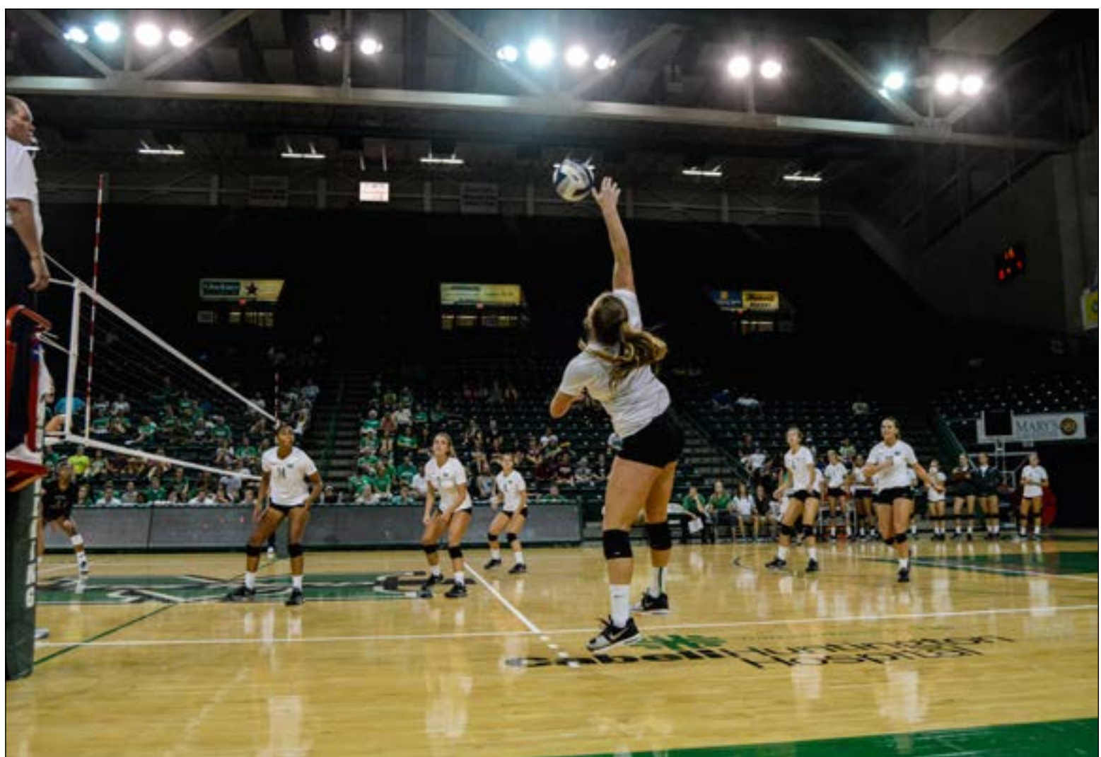
Members of the Marshall University volleyball team attempts to score against Eastern Kentucky University during the Herd's season-opening match Sept. 1.