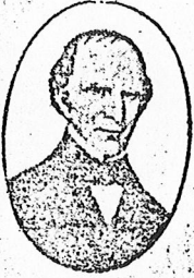
GOV. WM. H. CABELL FOR WHOM COUNTY WAS NAMED