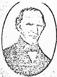
GOV. WM. H. CABELL FOR WHOM COUNTY WAS NAMED