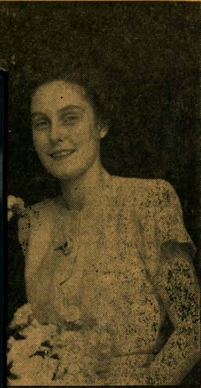
...d leaving the Coalwood Community Sunday.