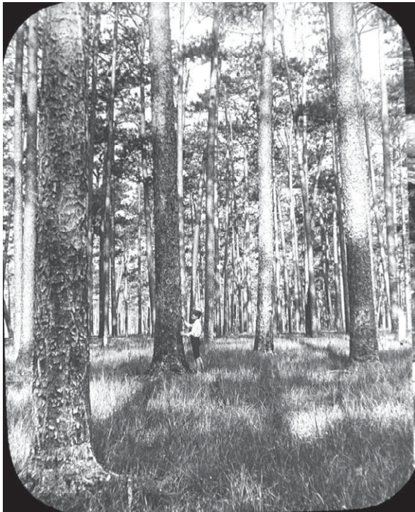
Fig. 2. Photograph of old-growth Pinus palustris stand, ca. 1902, Baldwin County, Alabama. American Environmental Photographs Collection, Image Number AEP-ALS1, Department of Special Collections, University of Chicago Library.

The papers of this special issue are grouped according to their area of emphasis into two broad subjects regarding the ecology and conservation of longleaf pine ecosystems. The first group comprises papers that address patterns and mechanisms of pine savanna biodiversity. Considering that most of the biodiversity of any forested ecosystem occurs in the lower vegetation strata, it is not surprising that most of the focus is on the diversity of the ground cover. The second group comprises papers that focus more specifically on conservation issues regarding longleaf pine savanna restoration and that develop models to further our understanding of how management and natural disturbances are related to conservation.