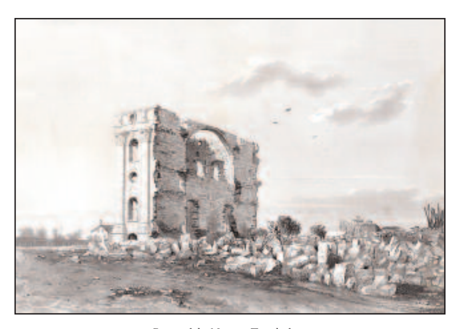
Ruins of the Nauvoo Temple from Route from Liverpool to Great Salt Lake Valley by Frederick Piercy.

no trace of the temple remained, except its well, on the temple block.