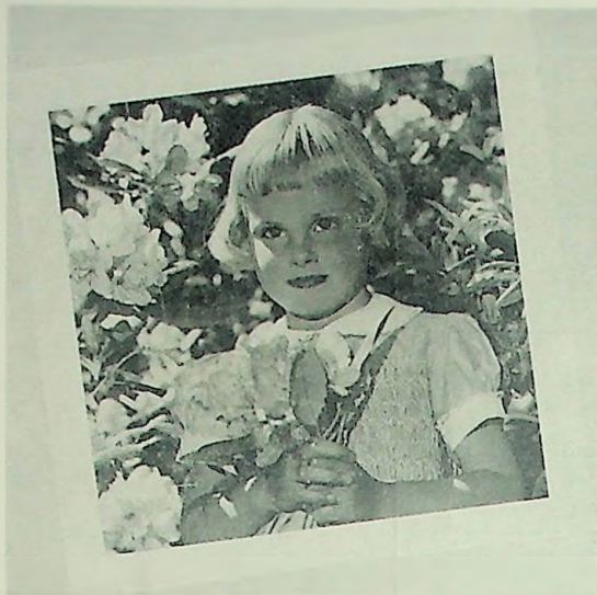
A Beautiful Bride — 14 years early.