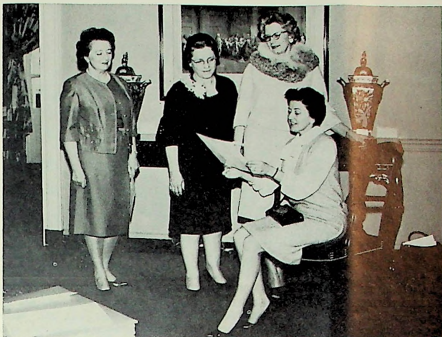
"The Winners" (See story at right)