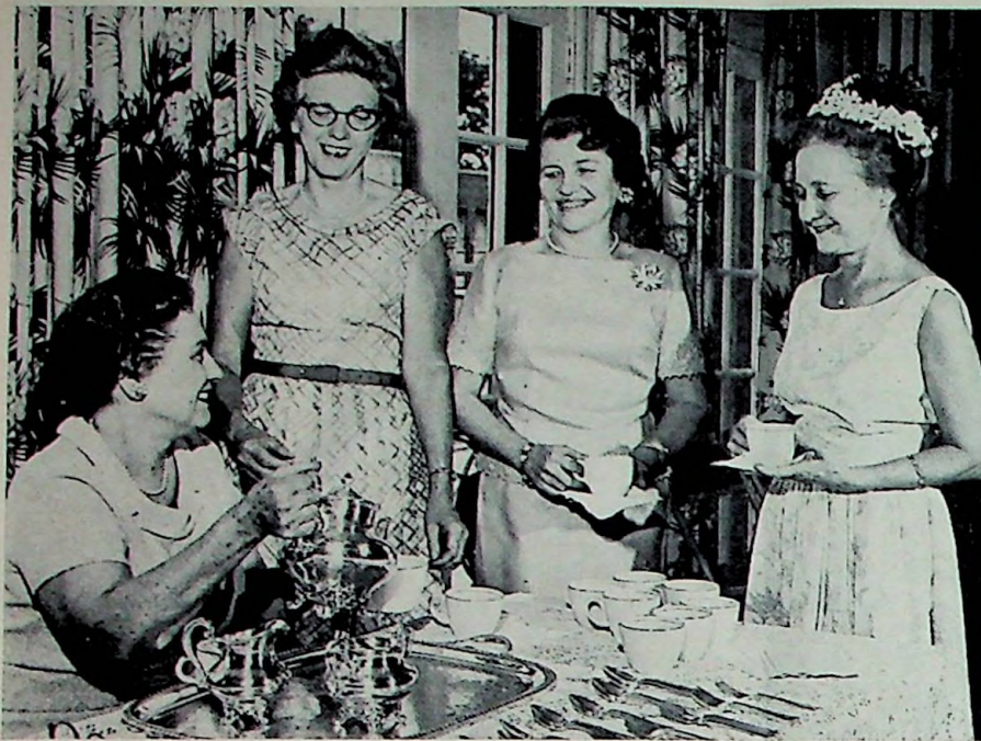
COFFEE FOR A VIP