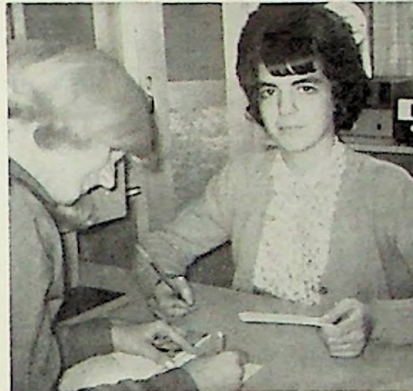
Pictured is a Sub-Juniorette aiding a high school student in checking out a book.

The Juniors and Sub-Juniorettes lend a helping hand by typing cards, taking pictures, and helping interested persons find books on their reading and interest level.