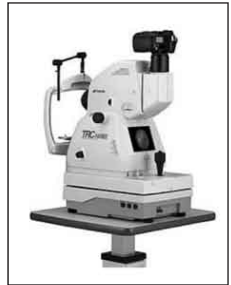
Figure 3. Topcon TRC-NW6S Non-Mydriatic Retinal Camera.

pathology identified in 288 patients (Table 2). The most common finding was glaucoma suspect (34%) and the targeted problems of diabetic retinopathy and hypertensive retinopathy were present in 15.6% and 4.2% of this group respectively. Examples of typical images taken using the retinal camera are shown in Figure 2A. Based upon the specific pathology identified, the following recommendations were provided to the patients as determined by the reviewing ophthalmologist: (1) follow up evaluation in one year, (2) immediate referral to a retina consultant, (3) immediate referral to a glaucoma specialist, (4) formal ophthalmic evaluation in one month, or (5) No specific instruction. (Table 3)