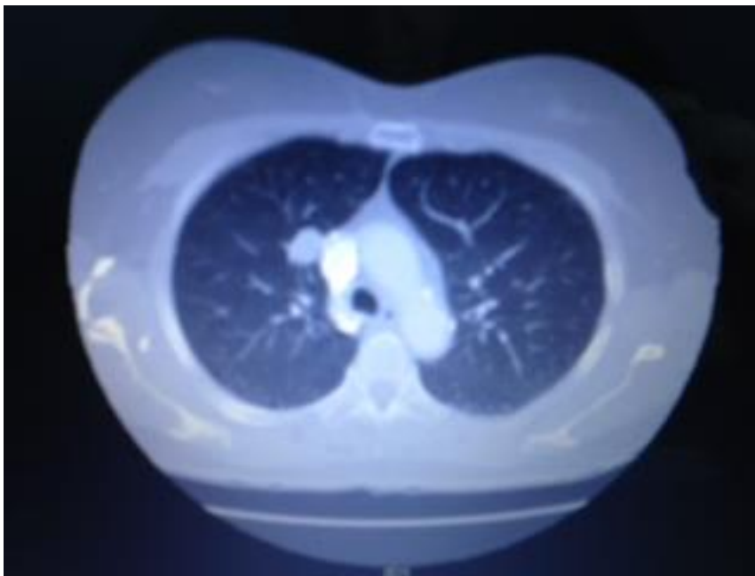
Figure 1: Chest CT scan showing right upper lobe mass confirmed on biopsy to be non small cell carcinoma. Routine CT scanning was used and there was no evidence of endobronchial disease.

A 63 year old Caucasian female with a reformed smoking history presented with an occasional dry cough for several months. Chest CT scan showed some minor right lower lobe atelectasis in addition to a right upper lobe pulmonary mass 1.8 x 1.4 cm, located medially in the upper lobe adjacent to the superior vena cava but with no radiographic evidence of mediastinal invasion. (Figure 1) Bronchoscopy by her pulmonologist noted a “polyp” in the bronchus intermedius. No attempt was made to biopsy the endobronchial lesion. The RUL lung lesion could not be accessed for biopsy but brushings, washings and lavage cytology were all non diagnostic. CT directed needle biopsy of the parenchymal lesion showed squamous carcinoma of the right upper lobe. Pet scan showed hypermetabolism in the right upper lobe mass and no evidence of mediastinal, endobronchial or distant hypermetabolism.