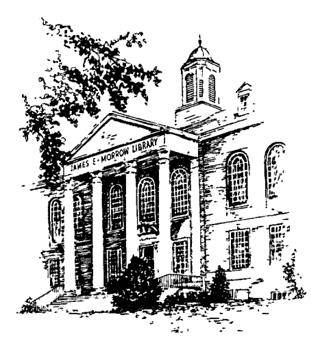
MU Printing Services