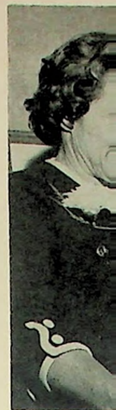
AT THE GR President is s President and