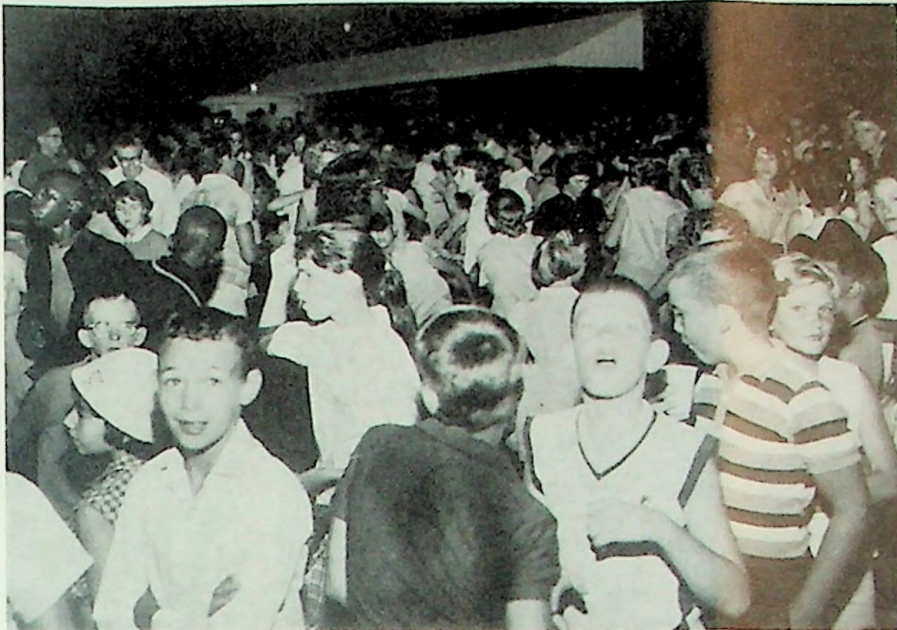
YOUNGSTERS OF BLUEFIELD ENJOYING A "STREET DANCE" given by the Bluefield Juniors. Event staged at a local parking lot on a Saturday evening between 7:30 and 10:30. Danced to all the latest records.