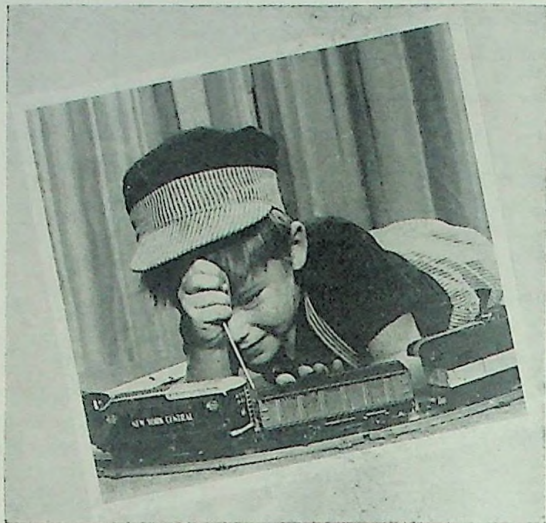
Picture of a Future Leader

We have reduced our Kodacolor Developing and printing prices, but not our quality. Finish that roll of film and send to Best Photo Service for prompt expert finishing.