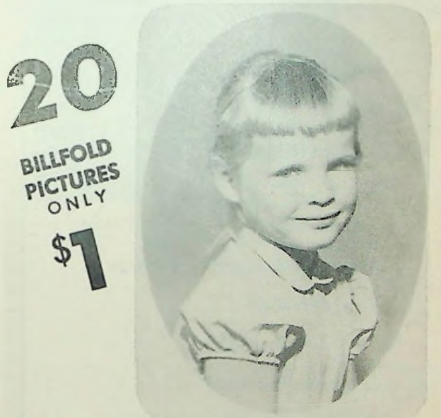
(Above Billfold Made From Oval Picture)

FROM PORTRAIT, CLASS PHOTO, PICTURE OR WEDDING