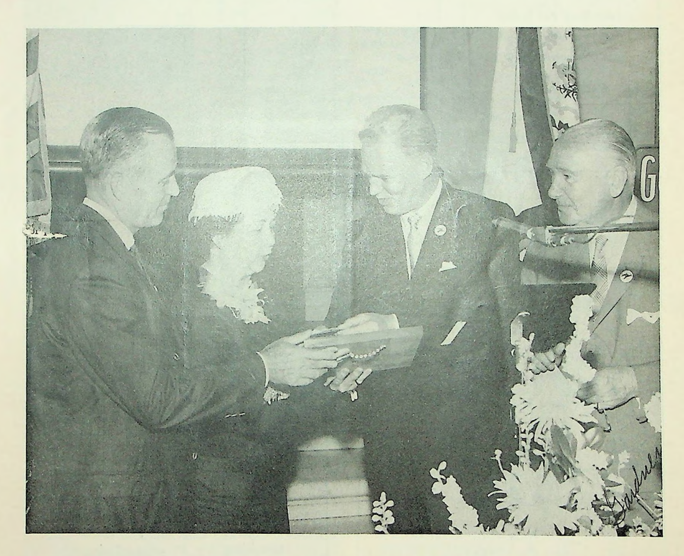
$1,000 Centennial Beautification Award Presented