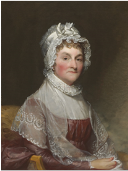
Abigail Adams famously reminded her Founding Father husband, John Adams, to “remember the ladies,” in the newfound spirit of independence.