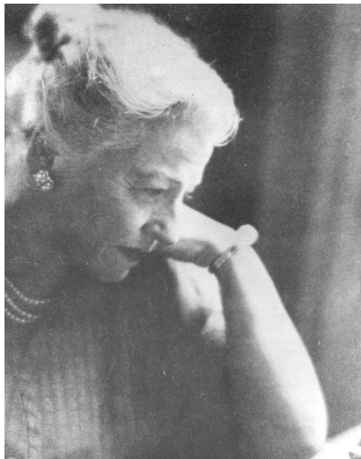
Pearl Buck was born in Hillsboro, Pocahontas County. Though she was only a resident of the state for a brief moment, she would return to the area whenever her parents returned from their overseas missionary work. She was the first female recipient of the Nobel Prize for Literature in 1938.