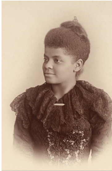
Ida Wells Barnett used her skills as an educator, journalist, and activist to expose the sexist and racist violence that was her lived experience. Her work in urban reform was influential in shaping the Progressive Movement.