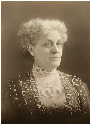
Carrie Chapman Catt was a key figure in the women’s suffrage movement in the USA which provided the impetus in winning the right to vote for women.