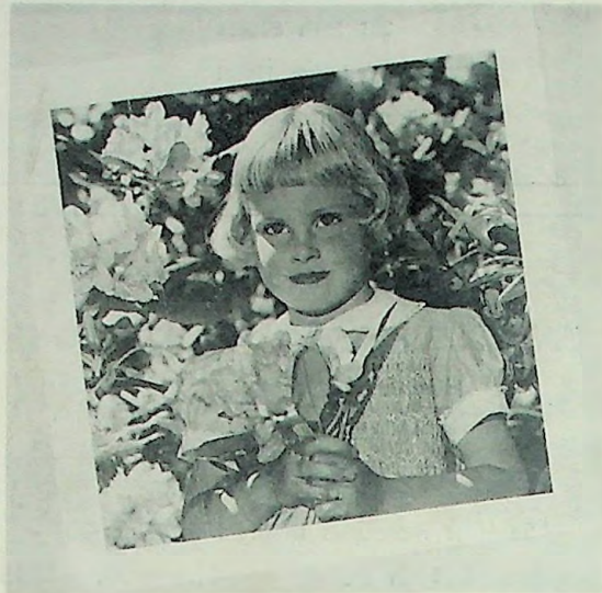
A Beautiful Bride — 14 years early.

Pictures record the happy time of Fall — that final picnic, the new outfit, the last swim, that exciting vacation, or Dad raking the leaves. Whatever you are doing snap a picture in color — you will be glad you did.