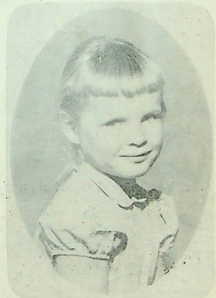
(Above Billfold Made From Oval Picture)

FROM YOUR PORTRAIT, CLASS PHOTO, OR WEDDING PICTURE