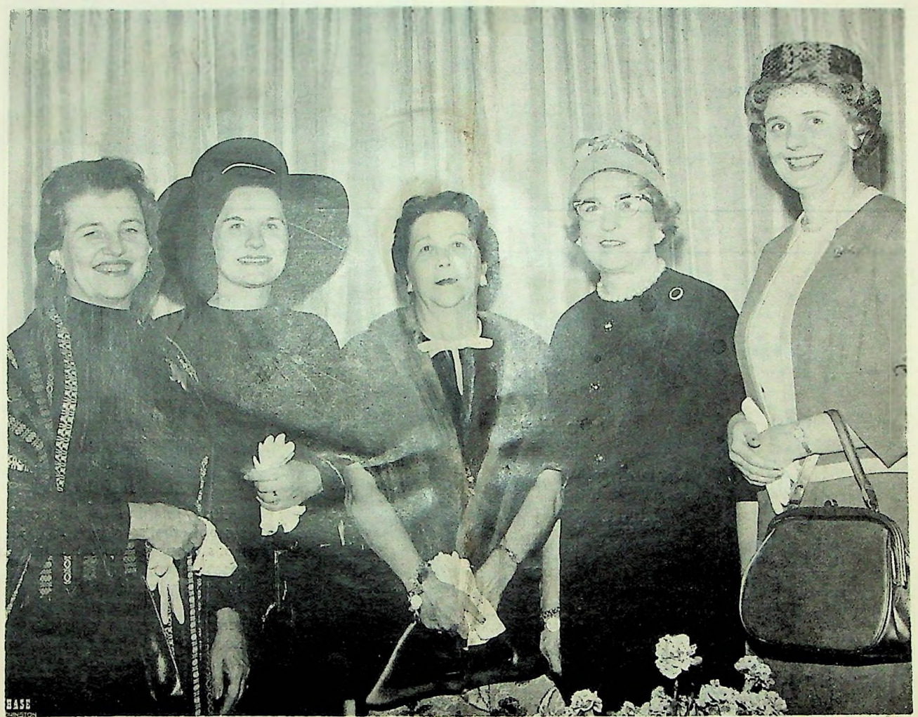
West Virginia Clubwomen on GFWC Board