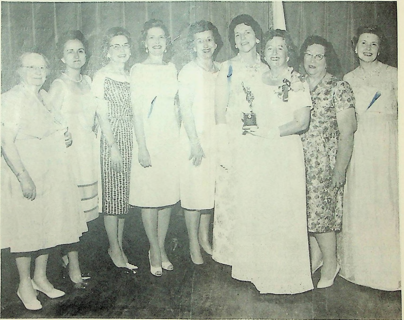
Congratulations Grafton! Community Improvement Winners