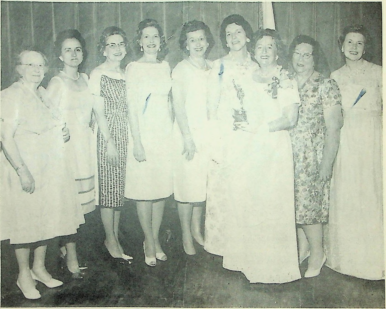
Congratulations Grafton! Community Improvement Winners