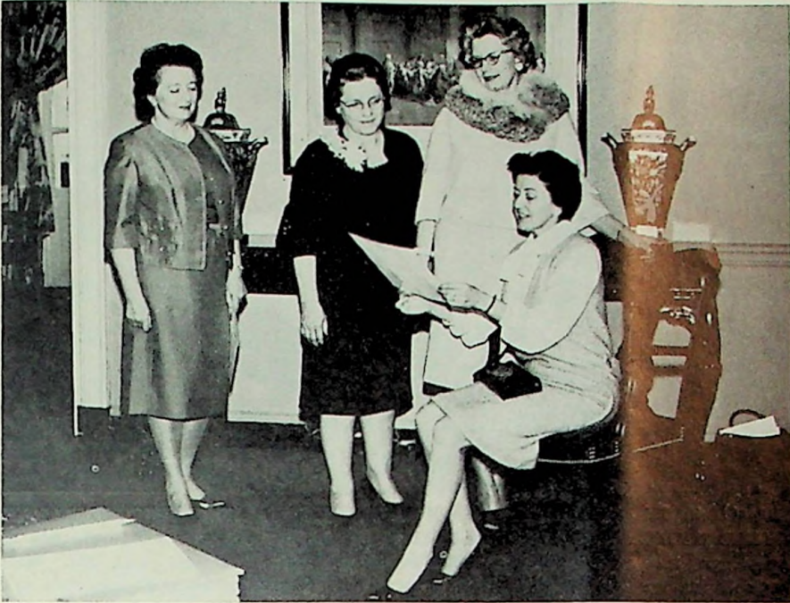
"The Winners" (See story at right)