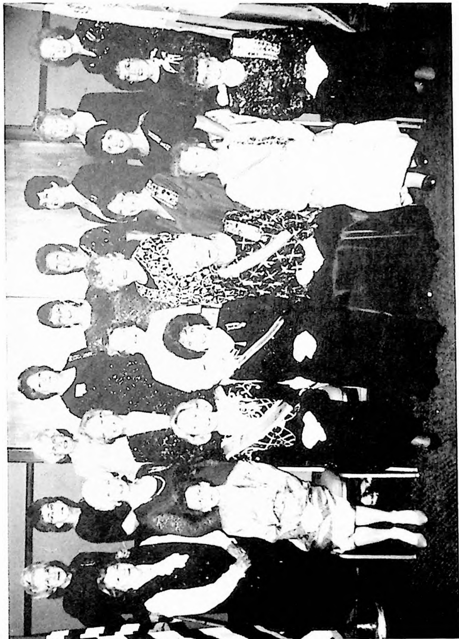
CHAPTER REGENTS 1997