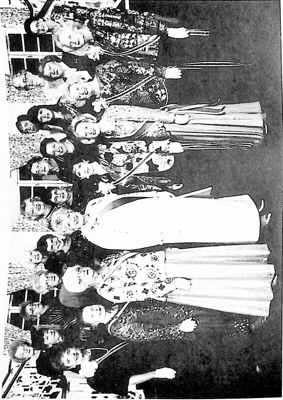
CHAPTER REGENTS 1996