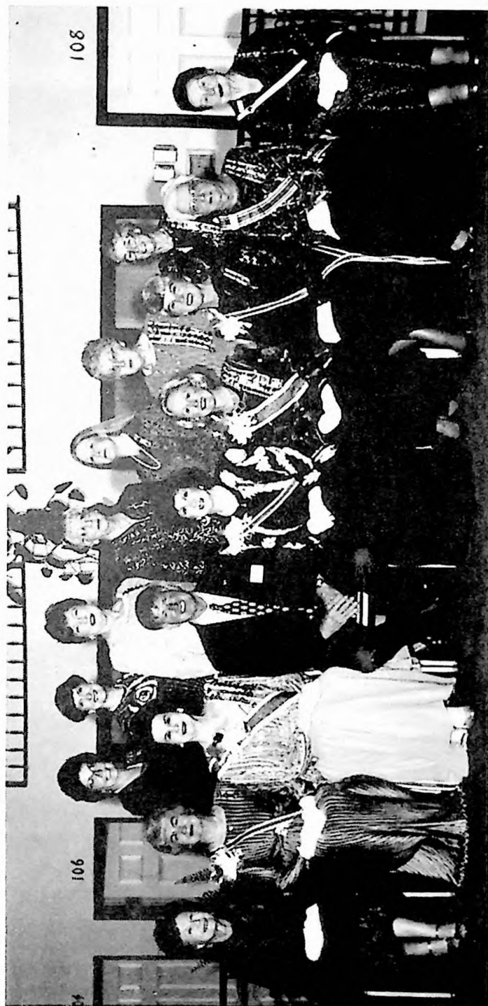
State Officers 1995