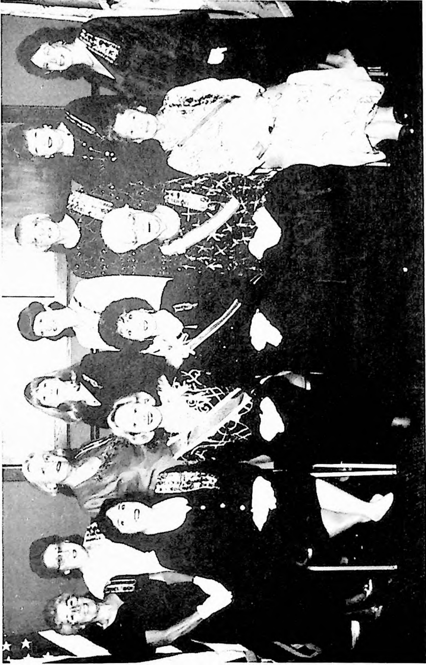
STATE OFFICERS 1997