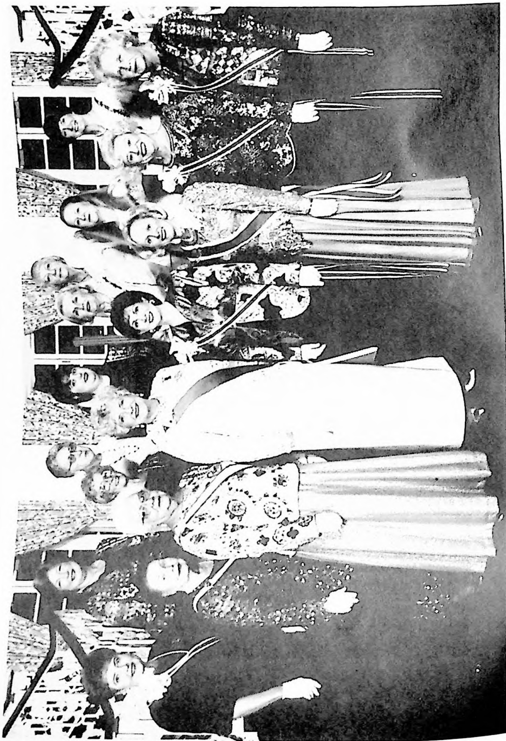
STATE OFFICERS 1996