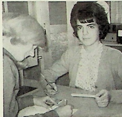
Pictured is a Sub-Juniorette aiding a high school student in checking out a book.

The Juniors and Sub-Juniorettes lend a helping hand by typing cards, taking pictures, and helping interested persons find books on their reading and interest level.