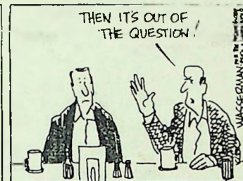
Update on ARMS CONTROL, see page 3.

League of Women Voters 2738 Washington Blvd. Huntington, WV 25705