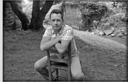
Featured 2014 Conference Keynote Address by Silas House

“Our Secret Places in the Waiting World: Becoming a New Appalachia”