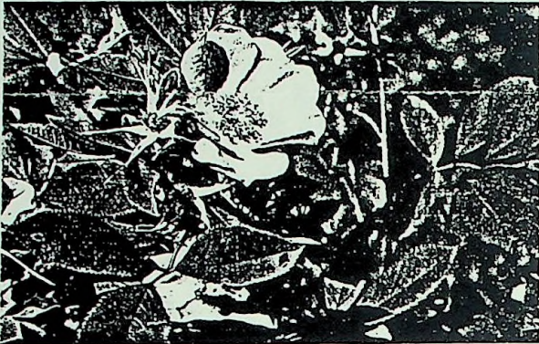
SWAMP ROSE. Greenbottom is sometimes called Glenwood Bend or Swamp.

The Huntington Area League is working with the Tri-State Audubon Society to protect Greenbottom Swamp from flooding by the Department of Natural Resources. Rather than schedule a separate meeting on this issue, we encourage League members to attend the Audubon Meeting (Sept 22) and Field Trip (Sept 24), details page 2. These are occasions to learn more about the unique area and the various positions on the subject.