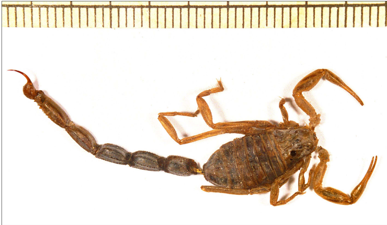
Figure 6: Buthacus spatzi , female paralectotype No. 2 of Androctonus (Leiurus) leptochelys , dorsal aspect.

Ehrenberg in Hemprich & Ehrenberg, 1831: 5 (in part), Moritz & Fischer, 1980: 317 (in part); Braunwalder & Fet, 1998: 33 (in part). Buthus leptochelys : Kraepelin, 1891: 202 (in part); Pocock, 1895: 299 (in part); Kraepelin, 1901: 266 (in part). Buthus (Buthacus) spatzi Birula, 1911: 137; Birula, 1917b: 214. Buthacus spatzi : Caporiacco, 1937: 349; Pallary, 1937: 100; Levy et al., 1973: 138; Levy & Amitai, 1980: 76; Fet & Lowe, 2000: 85; Crucitti & Vignoli, 2002: 440. Buthacus arenicola spatzi : Vachon, 1951: 3; El-Hennawy, 1992: 112; Kovařík, 1998: 105.