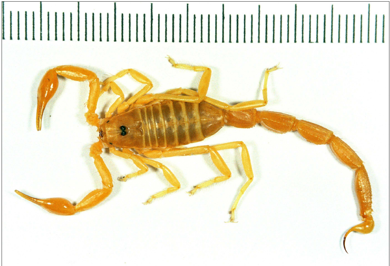
Figure 3: Buthacus ehrenbergi sp. n., male holotype, dorsal aspect.