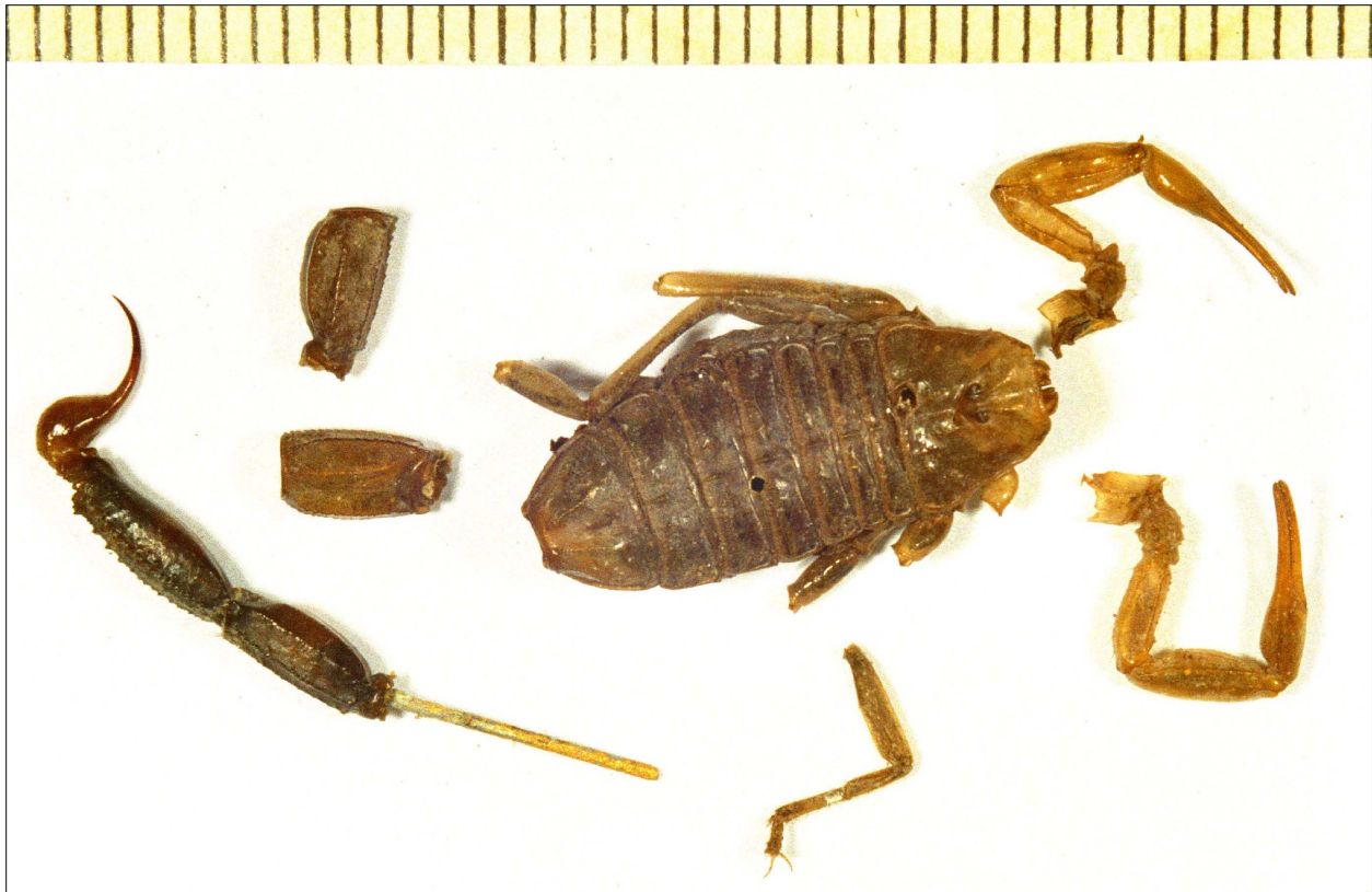
Figure 5: Buthacus leptochelys , female lectotype, dorsal aspect.