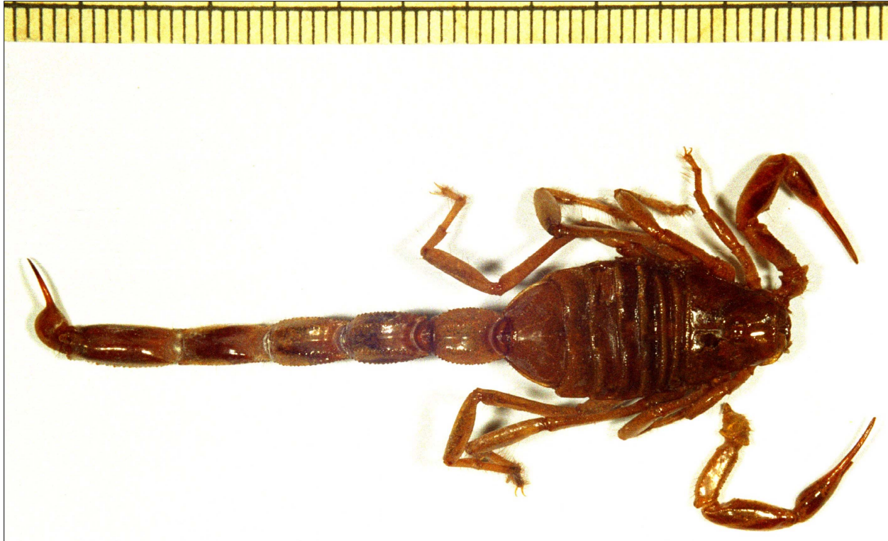
Figure 8: Buthacus macrocentrus , female lectotype, dorsal aspect.

reach at most one-third of segment length (usually more pronounced and longer in males). Fourth metasomal segment with dorsal carinae either smooth or granulate and ventral carinae strongly granulate. Fifth metasomal segment usually lacks carinae but bears a ventromedian carina and two ventrolateral carinae composed of unevenly sized granules. Much of metasoma between carinae smooth, granulate only on ventral surface of fifth segment. Metasoma and telson densely hirsute.