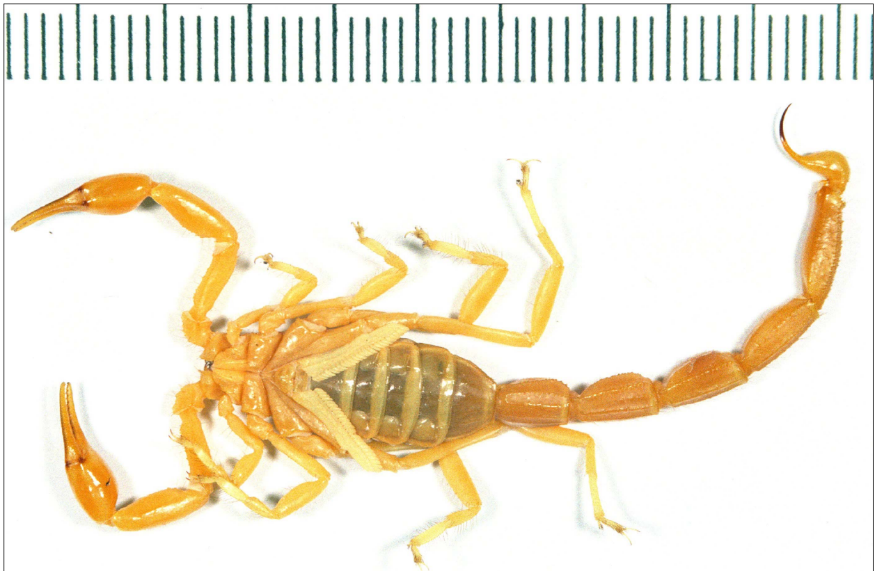
Figure 4: Buthacus ehrenbergi sp. n., male holotype, ventral aspect.