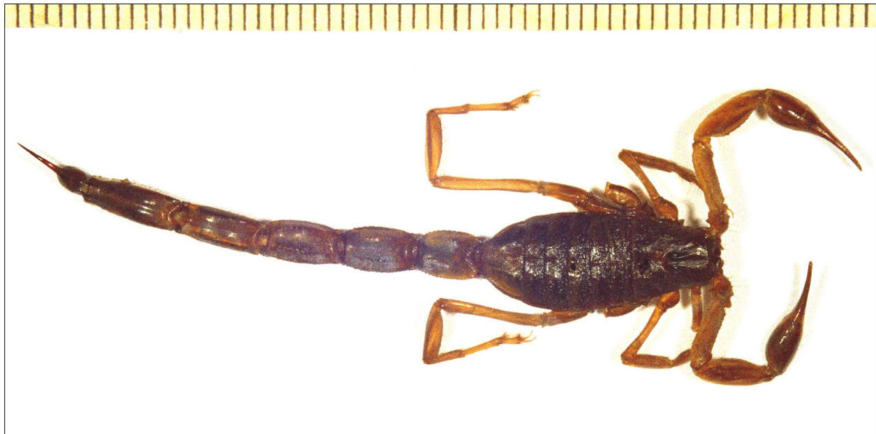
Figure 7: Buthacus leptochelys , male lectotype of Androctonus (Leiurus) thebanus , dorsal aspect.

Hemprich & Ehrenberg, 1831: 5 (in part); Moritz & Fischer, 1980: 317 (in part); Braunwalder & Fet, 1998: 32 (in part). = Buthus tadmorensis Simon, 1892: 84; Kraepelin, 1895: 83; Birula, 1905: 136; Habibi, 1971: 43. Syn. n. Buthus (Buthacus) tadmorensis : Birula, 1910: 172; Birula, 1917a: 229. Buthacus tadmorensis : Simon, 1910: 76; Vachon, 1966: 210; Farzanpay, 1988: 36; Kovařík, 1997: 49; Kovařík, 1998: 105; Kovařík, 2001: 80; Fet & Kovařík, 2003: 180. Buthacus tadmorensis tadmorensis : Vachon & Kinzelbach, 1987: 101; Kovařík, 2002: 5; = Buthus pietschmanni Penther, 1912: 112 (syn. by Birula, 1917a: 229). Mesobuthus pietschmanni : El-Hennawy, 1992: 128. = Buthacus yotvatensis Levy et al., 1973: 130; Levy & Amitai, 1980: 90; Kinzelbach, 1984: 99; Vachon & Kinzelbach, 1987: 100; Fet & Lowe, 2000: 85; Crucitti & Vignoli, 2002: 439; Soleglad & Fet, 2003a: 5; Soleglad & Fet, 2003b: 7 (syn. by Kovařík, 2001: 80). Buthacus yotvatensis yotvatensis : Vachon, 1979: 36; Fet & Lowe, 2000: 85. Buthacus tadmorensis yotvatensis : Vachon & Kinzelbach, 1987: 101; Amr et al., 1988: 374; El-Hennawy, 1992: 114; Kabakibi et al., 1999: 82. Androctonus macrocentrus : ICZN, 2000: 7.