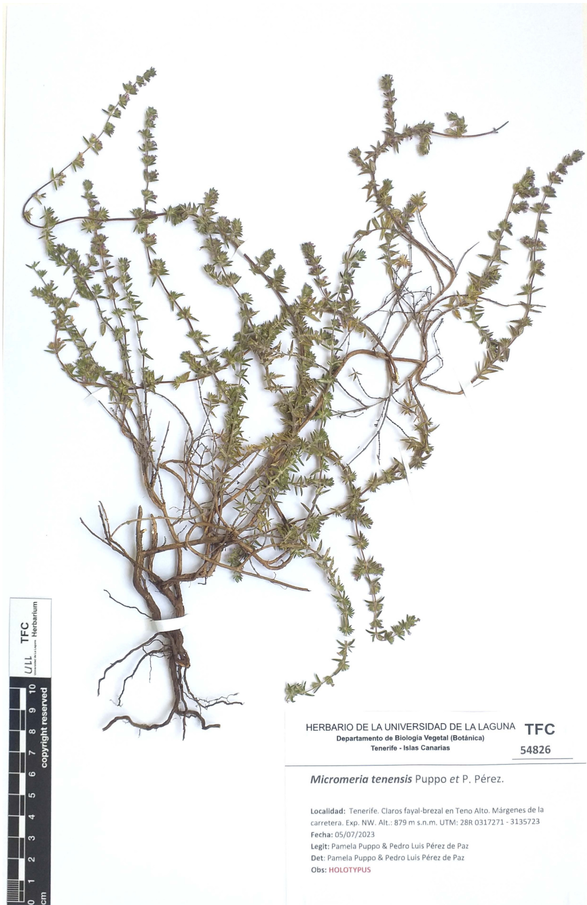
FIGURE 2. Holotype of Micromeria tenensis Puppo & P. Pérez (TFC 54.826).