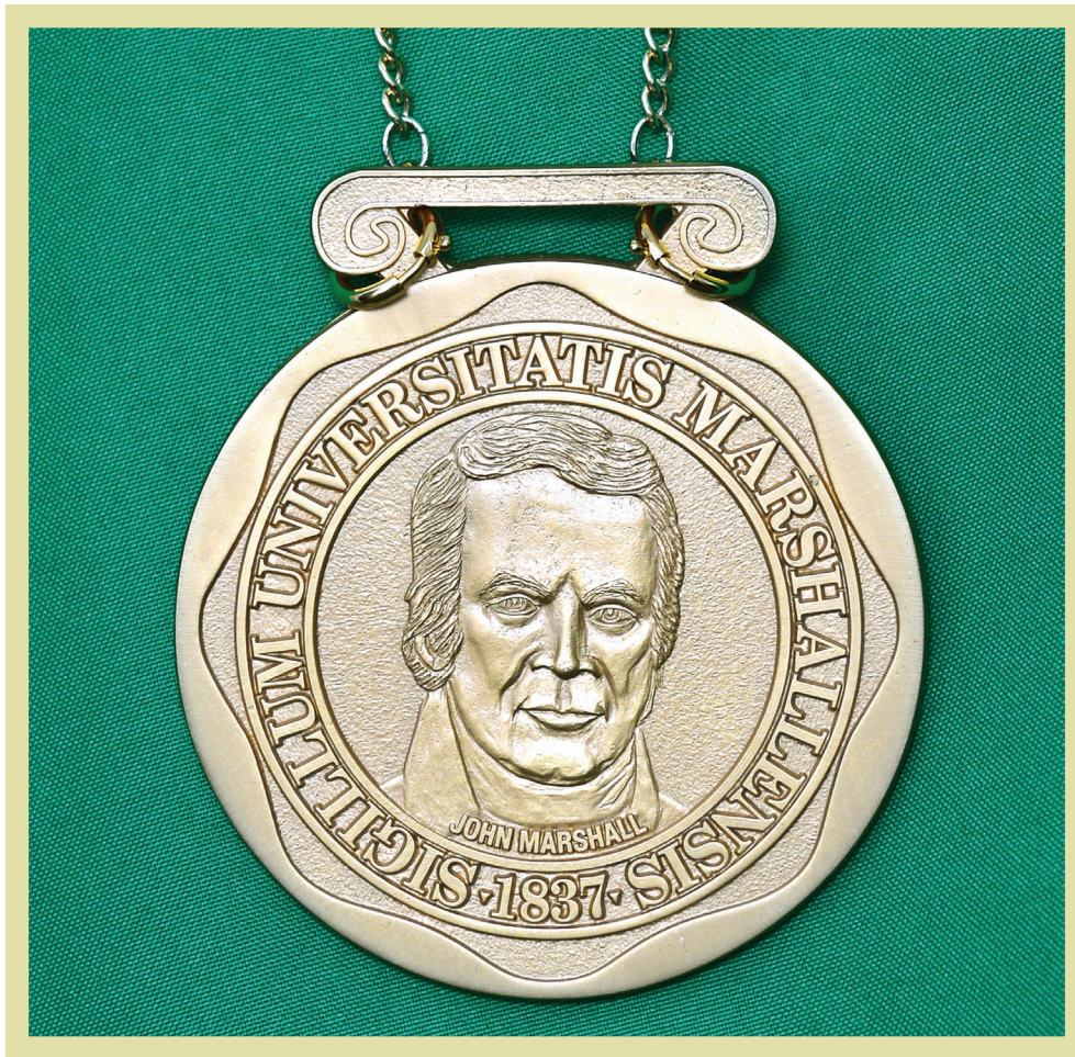
The President's Medallion and Grand Mace

Marshall University traces its origins to the founding of the Marshall Academy in 1837. The Academy was named in honor of John Marshall, the fourth Chief Justice of the United States Supreme Court, who died on July 6, 1835.