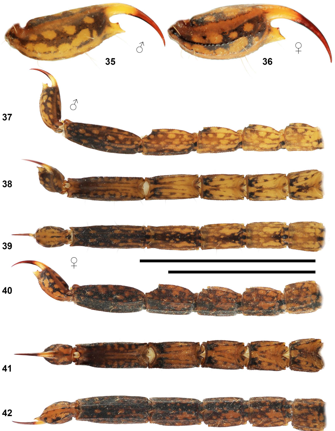
Figures 35–42: Lychas jakli sp. n. Figures 35, 37–39. Holotype male, telson lateral (35), metasoma and telson, lateral (37), dorsal (38) and ventral (39). Figures 36, 40–42. Paratype female, telson lateral (36), metasoma and telson, lateral (40), dorsal (41) and ventral (42). Scale bars: 10 mm (37–39), 10 mm (40–42).