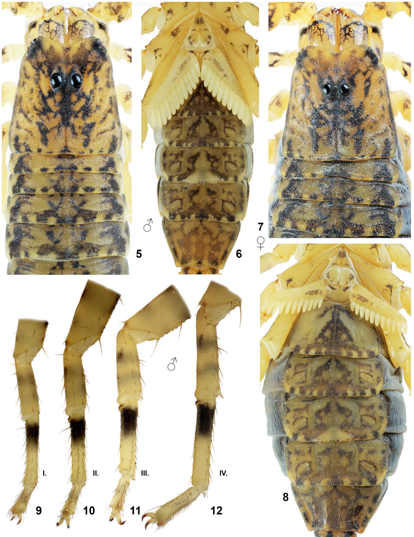
Figures 5–12. Lychas jakli sp. n. Figures 5–6, 9–12. Holotype male, carapace and tergites I–IV (5), sternoplectinal region and sternites (6), and left legs I–IV, retrolateral aspect. Figures 7–8. Paratype female, carapace and tergites I–III (7), sternoplectinal region and sternites (8).