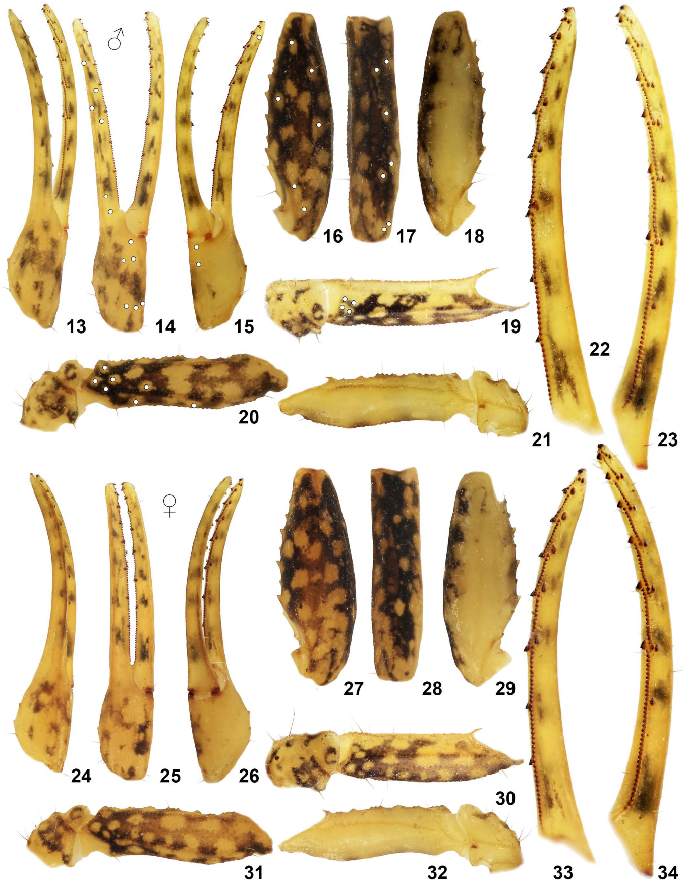
Figures 13–34: Lychas jakli sp. n., segments of pedipalps. Figures 13–23. Holotype male, right pedipalp. Chela, dorsal (13), external (14), and ventral (15) views. Patella, dorsal (16), external (17), and ventral (18) views. Pedipalp femur and trochanter, internal (19), dorsal (20), and ventral (21) views. Pedipalp chela, fixed (22) and movable (23) fingers dentate margins. The trichobothrial pattern is indicated in Figures 14–17, 19–20 (white circles). Figures 24–34. Paratype female, right pedipalp. Chela, dorsal (24), external (25), and ventral (26) views. Patella, dorsal (27), external (28), and ventral (29) views. Femur and trochanter, internal (30), dorsal (31), and ventral (32) views. Pedipalp chela, fixed (33) and movable (34) fingers dentate margins.