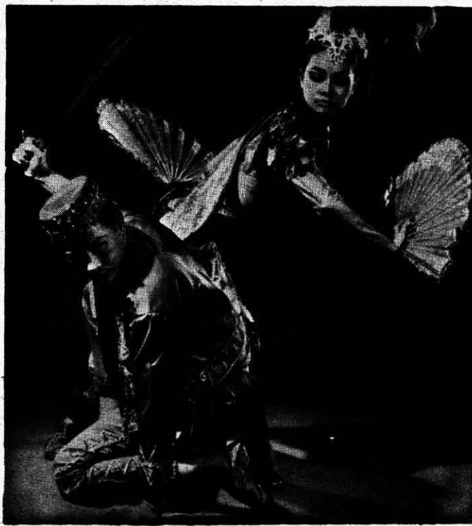
DANCERS PRESENT "INDARAPATRA" TUESDAY As part of Community Artist Series

The Daily Variety comments on the 1968 western tour of the group by saying, "What makes 'Bayanihan' an even greater treat is the singular beauty and talent of each of the femmes. Their grace and rhythm is exceptional, and each might be performing solo. Male dancers are fast and dynamic as they engage in sword duels with sparks flying and antics of the hunt."