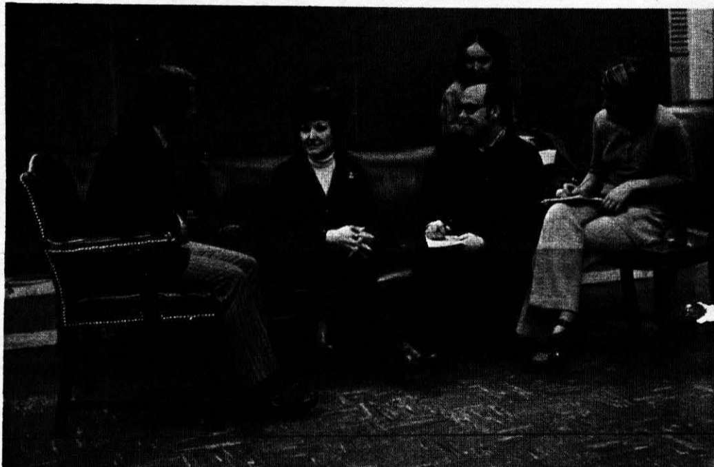
Parthenon photo by Gary Ramsey

Vol. 71 WEDNESDAY, DECEMBER 2, 1970 HUNTINGTON, W.VA. No. 43