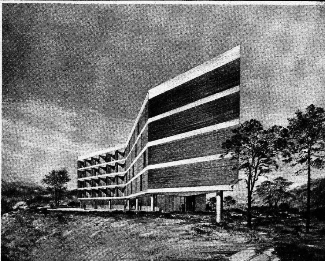
THE WILLIAMSON BRANCH of Marshall University has made an additional request of $252,000 to the Department of Health Education And Welfare for the completion of the new building now under construction. The photo shows the architect's conception of the structure which is scheduled for completion by September.