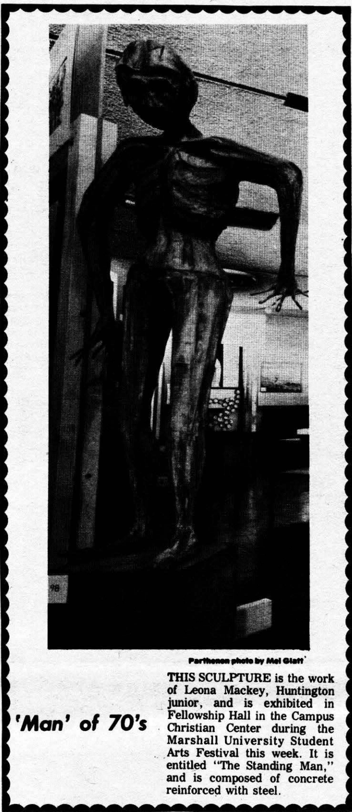
Parthenon

DEVELOPED BY A DOCTOR NOW USED BY MILLIONS OF WOMEN TAMPAX TAMPONS ARE MADE ONLY BY TAMPAX INCORPORATED PALMER MASS.