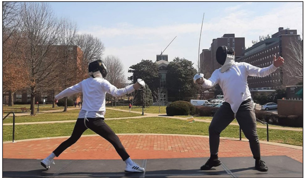
Members of the Fencing Club Practices outside the Memorial Student Center

The fencing club meets on Mondays and Wednesdays from 8 to 9:30 p.m. in room 1002 in the Cam Henderson Center. Information about the fencing club can be found on flyers around campus.