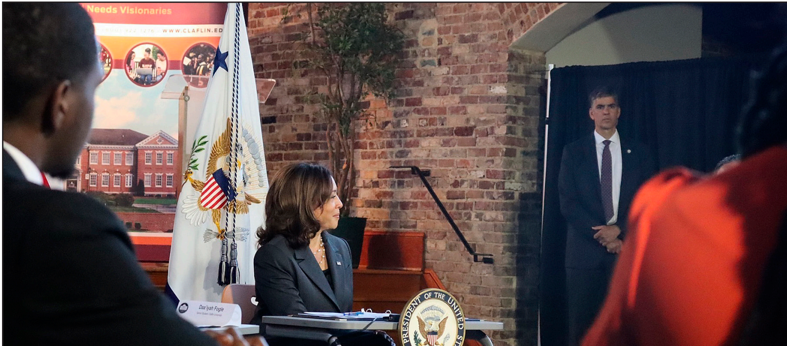
Vice President Kamala Harris speaks to students at Claflin University, one of two historically black universities she visited in Orangeburg, S.C. Harris pushed for voter registration as her party seeks to hold onto majorities in Congress.