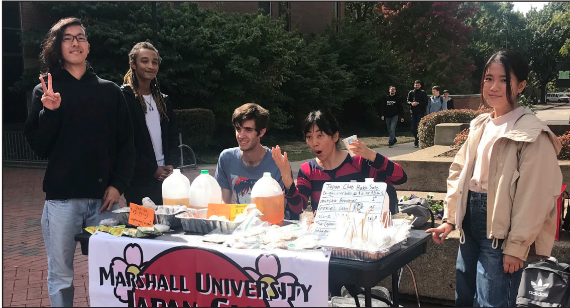
Japanese Club Bake Sale on the Student Center Plaza.