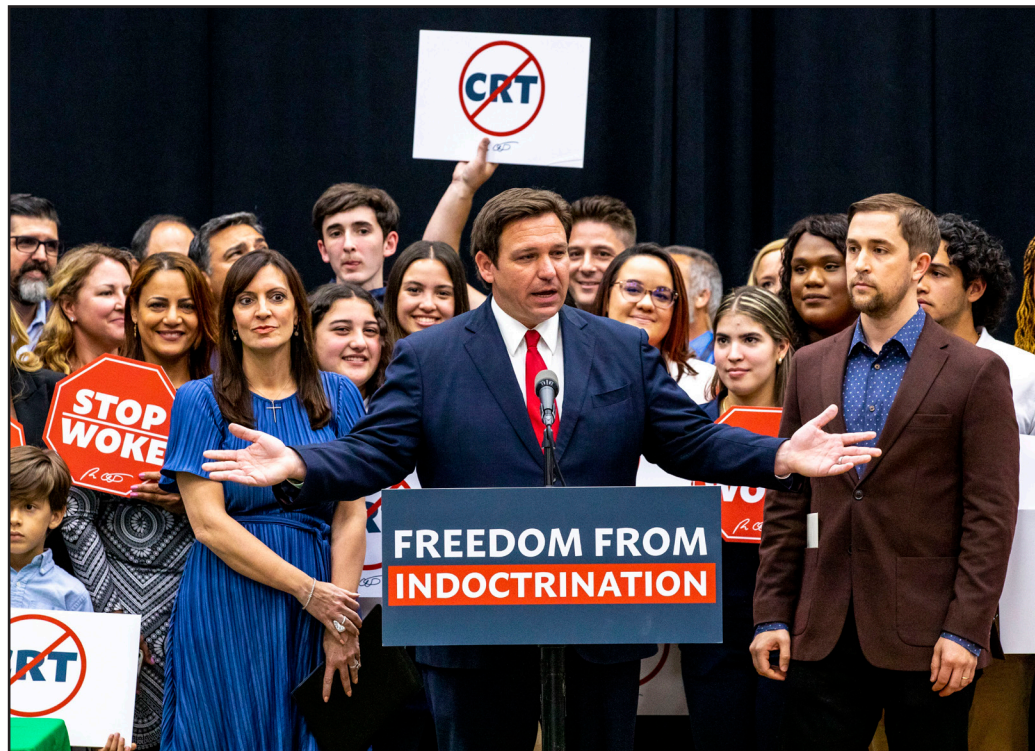
Florida Gov. Ron DeSantis addresses the crowd before publicly signing House Bill 7.