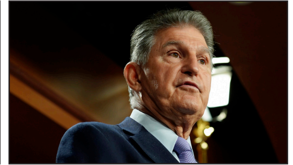
Senator Joe Manchin