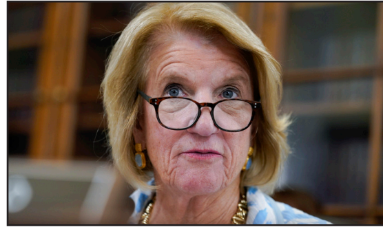
Senator Shelley Moore Capito