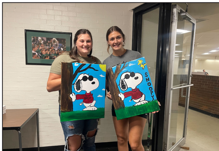
Students showing paintings they made at the event.

The next Paint and Sip will be Halloween themed and take place on Wednesday, Oct. 18, from 6-7 p.m.