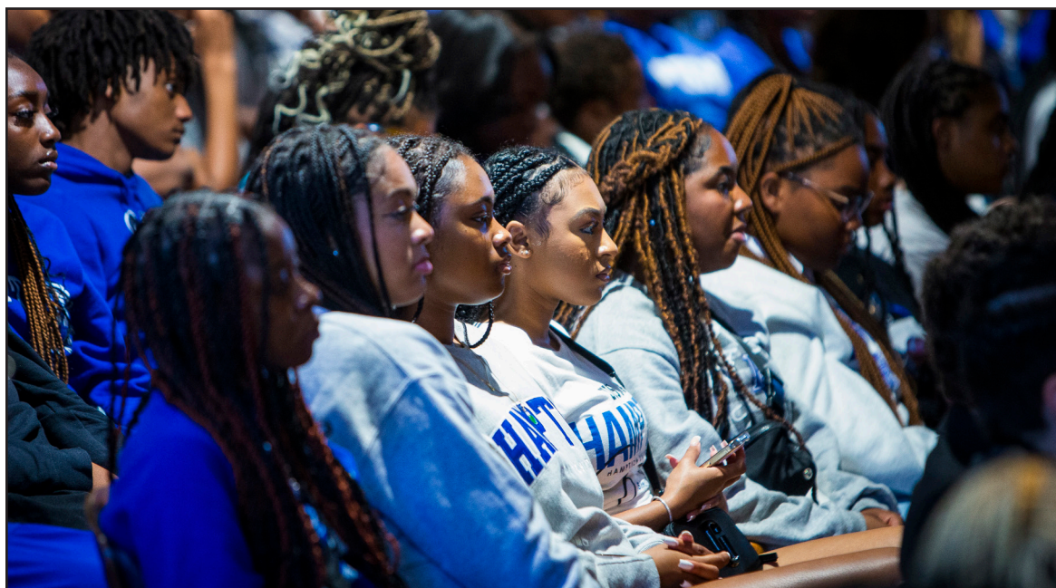
Hampton University students listen as Vice President Kamala Harris speaks at the university on Thursday, Sept. 14, 2023, in Hampton, Virginia.