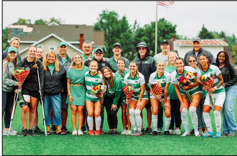
Senior players honored before the match.