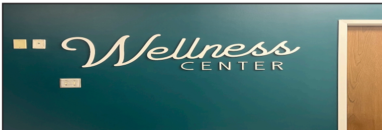
The Wellness Center is located at the Memorial Student Center.