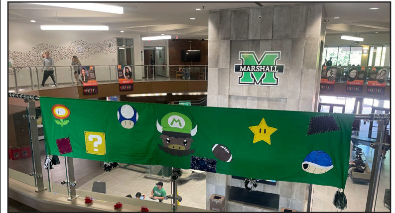
Banner for Super Marco Brothers theme