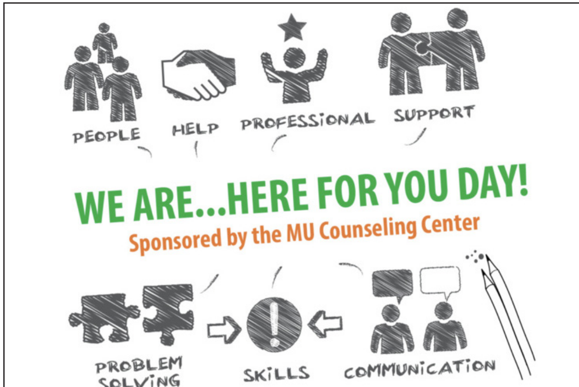
Graphic for We Are Here for You Day