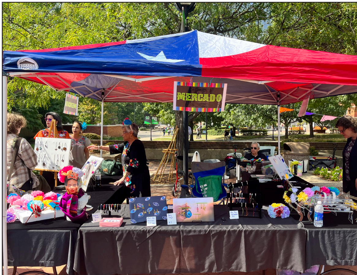
As a part of Marshall's Hispanic Heritage Month Kick-Off Fiesta, a market was set up selling jewelry outside of the Memorial Student Center.