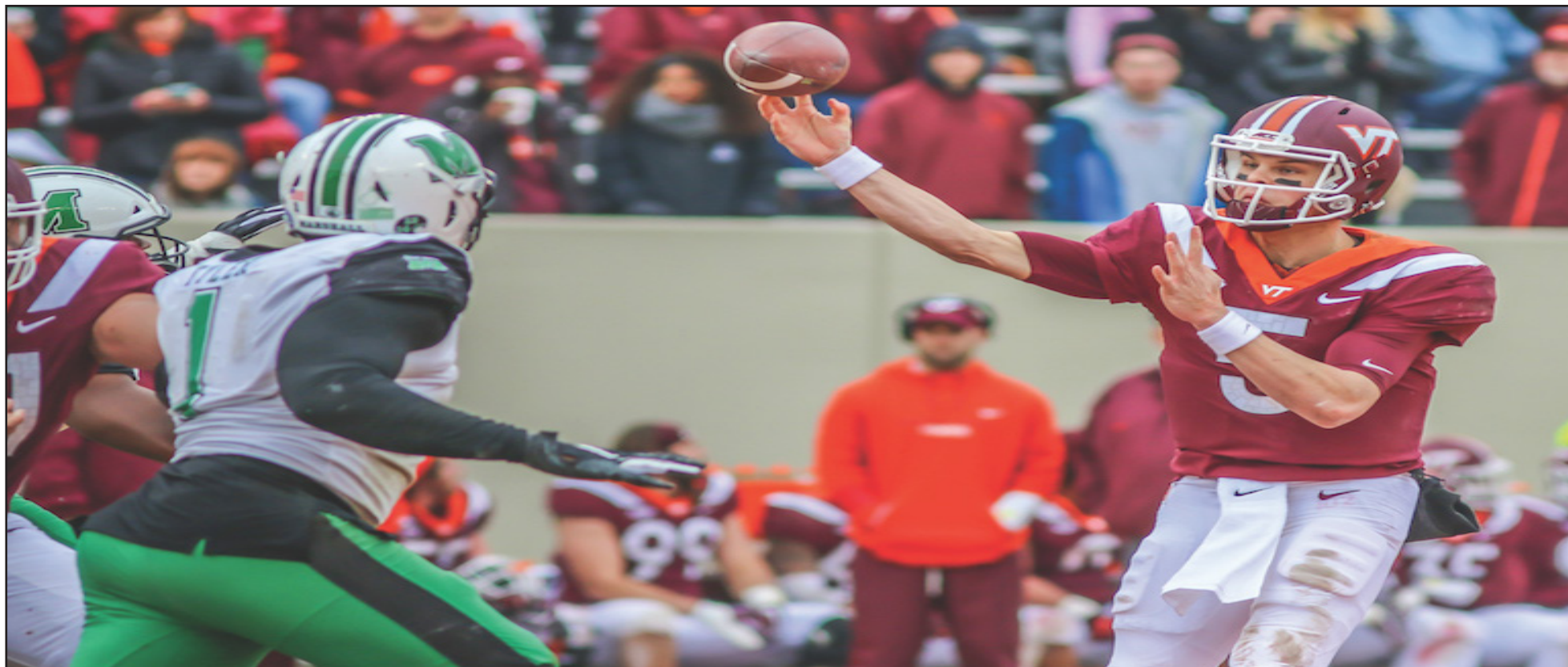
The Herd and Hokies play in 2018's matchup.