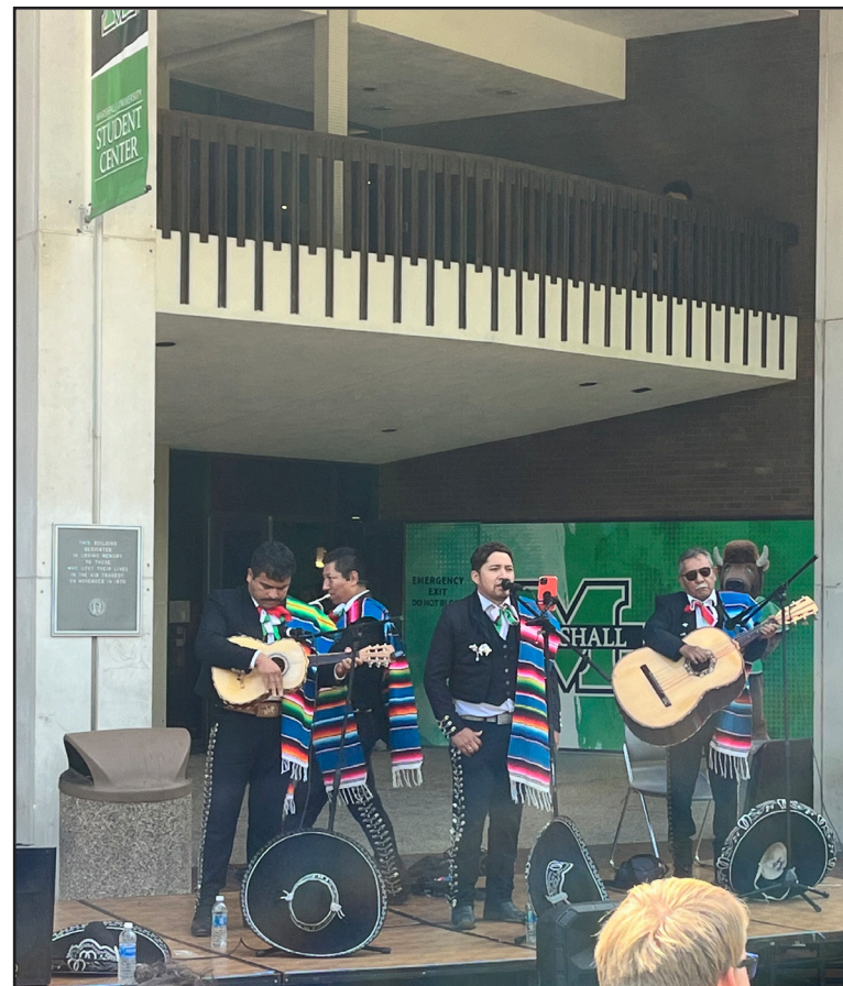
Mariachi Garibaldi performing as a part of the Hispanic Heritage Month Kick-Off Fiesta.