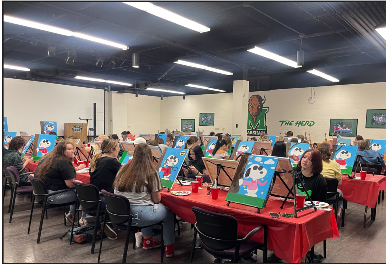
Students painting versions of Snoopy at the Paint and Sip event.