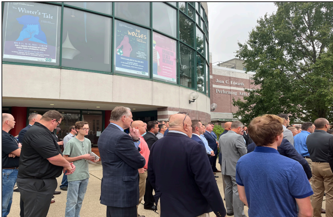
Attendees gathered outside the Joan C. Edwards Performing Arts Center, where the cases were heard Wednesday, Sept. 13.

Decisions for these three cases are anticipated to be reached this November.