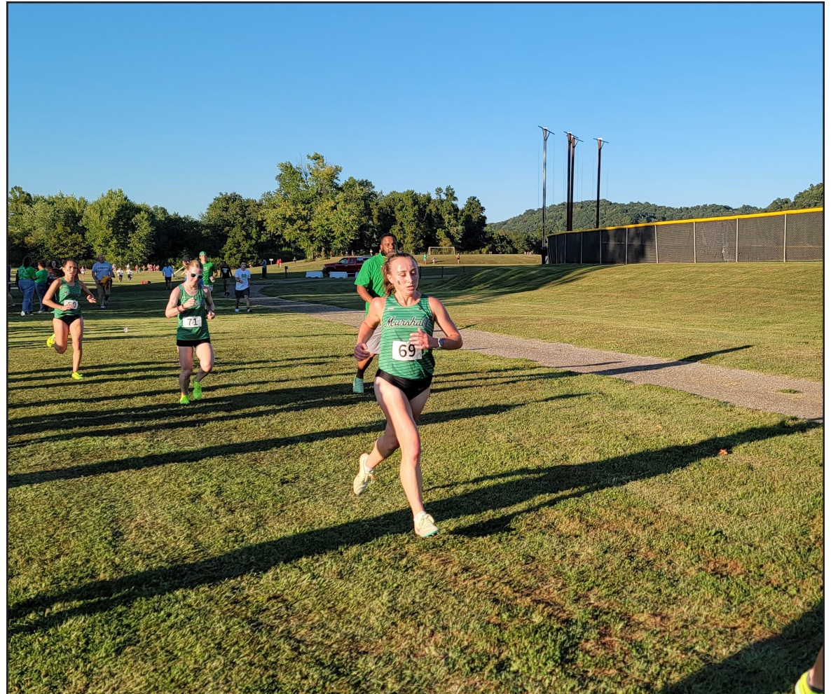
Women's cross country in action.