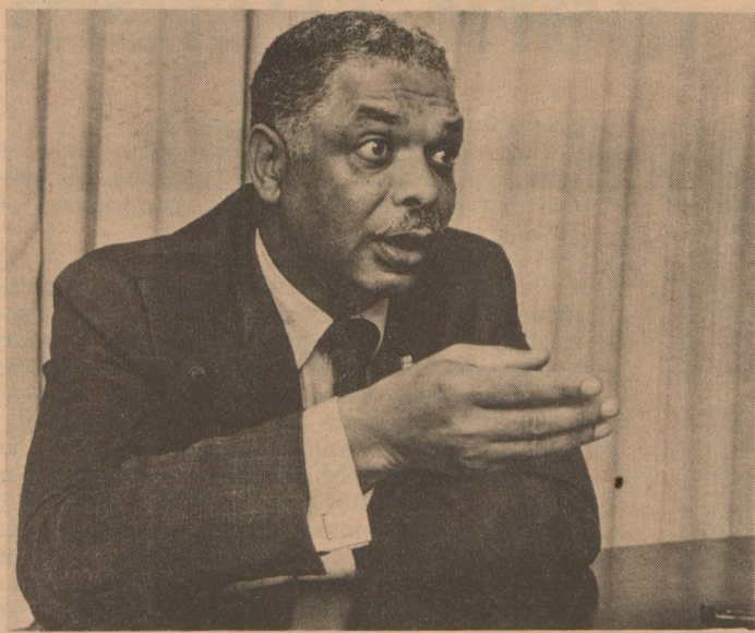
ACTOR ON SERIES TALKS ABOUT SMOKING He never thought of how a cigarette tastes