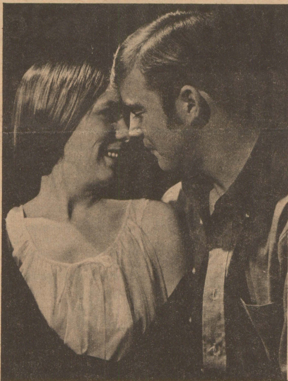
GIRLFRIEND AND BOYFRIEND EMBRACE in 'Summertree' in Old Main