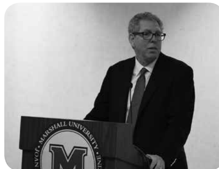
Dr. Jeffrey M. Friedman

The day-long conference featured a presentation given by Jeffrey M. Friedman, M.D., Ph.D., titled "Discovery of Leptin Gene and the Biologic Basis of Obesity." Dr. Friedman, who discovered the obesity gene leptin, is a professor at The Rockefeller University and an