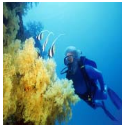
Jean-Michel Cousteau will appear at the Keith-Albee Thursday, Oct. 15.

Cousteau, son of legendary explorer Jacques