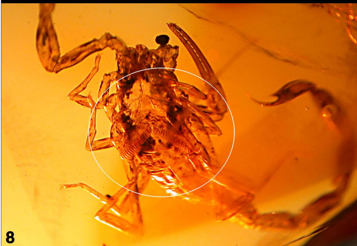
Figures 7–8: Tityus ( Brazilotityus ) hartkorni , sp. n. 1. Habitus, dorsal aspect. 2. Ventral aspect, showing coxapophyses, sternum, genital operculum, and pectines.